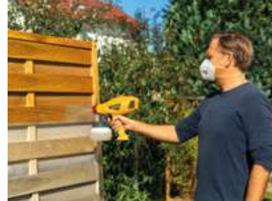
Apply weather protection quickly!