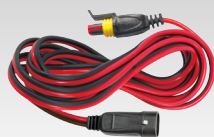
Extension 2.5 m - 029057