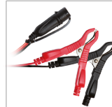
Clamps (45 cm)