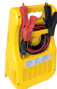
Cables and clamps stowage within the unit.